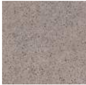
galibier VST20520583 Pattern Repeat L100 x W99.5 Drop 1/2 Reverse Lay