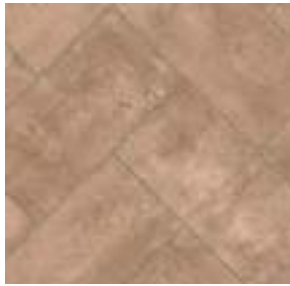
bilbao VST11520538 Pattern Repeat L100 x W99.5 Drop 1/2