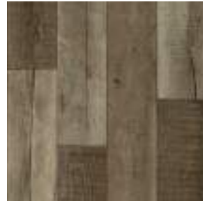
outback VST11720546 Pattern Repeat L150 x W99.5 Drop 1/2