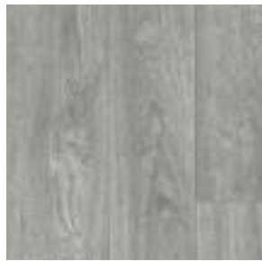
allure VST11920591 Pattern Repeat L120 x W99.5 Drop 2/3