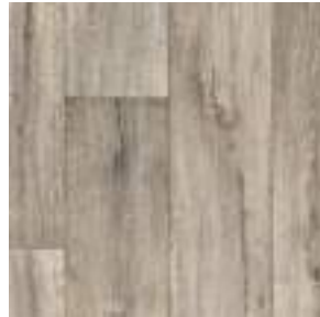
tundra VST20120592 Pattern Repeat L120 x W99.5 Drop 5/6