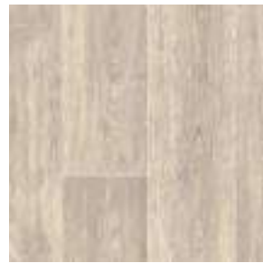
chaparral oak VST19320509 Pattern Repeat L100 x W99.5 Drop 1/2