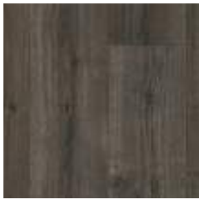
rioja VST19420596 Pattern Repeat L150 x W200 Drop 1/2