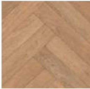
marilyn VST11620537 Pattern Repeat L100 x W199 Drop 1/2