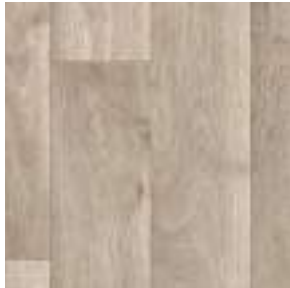
toronto VST10120507 Pattern Repeat L100 x W100 Drop 1/2