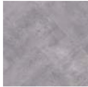
bilbao VST11520593 Pattern Repeat L100 x W99.5 Drop 1/2