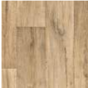
tundra VST20120532 Pattern Repeat L120 x W99.5 Drop 5/6