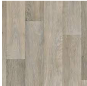
camargue VST16820593 Pattern Repeat L120 x W100 Drop 1/2