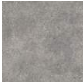
puno VST11820594 Pattern Repeat L100 x W100 Drop 1/2 Reverse Lay