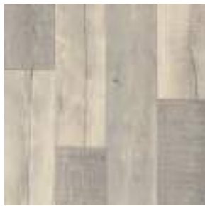
outback VST11720582 Pattern Repeat L150 x W99.5 Drop 1/2