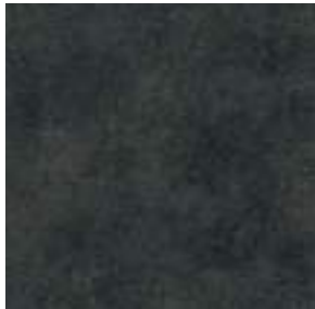
puno VST11820598 Pattern Repeat L100 x W100 Drop 1/2 Reverse Lay